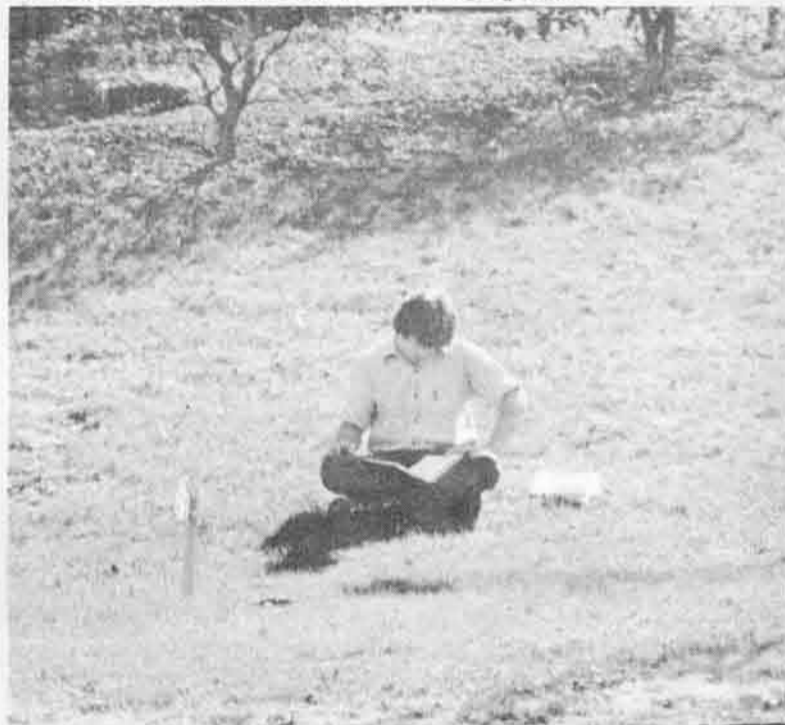
OUTDOOR EDUCATION: This student found the outdoors a preferable place to study.