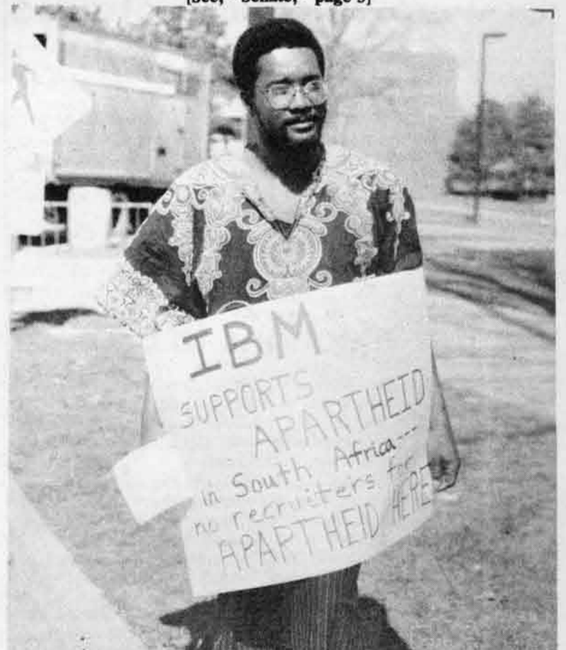
PROTESTING APARTHEID: A member of the UMSL Chapter of the International Committee Against Racism pickets IBM job recruitment on campus outside Woods Hall, March 30. The group protested the recruitment because IBM operates in South Africa.