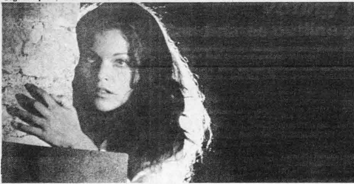
WHAT'S THIS? Amy Irving spies around a corner in 'The Fury'.