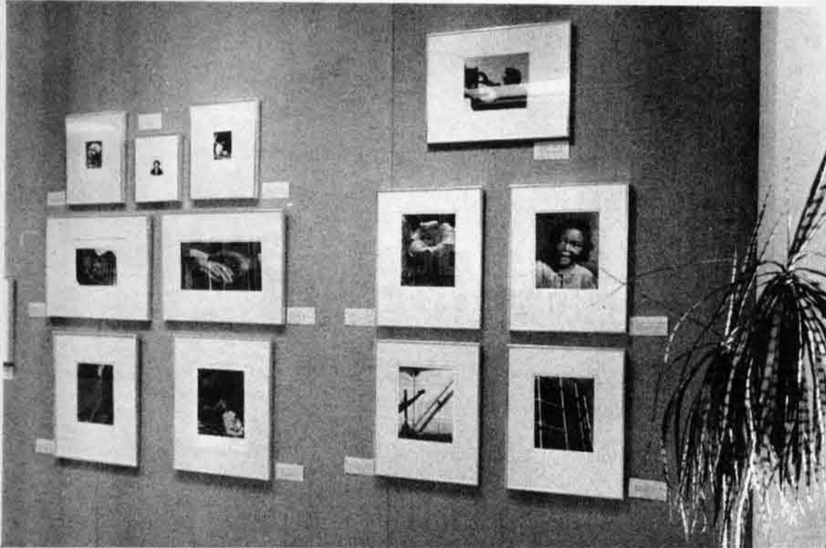
f-STOP: f-64 is a photography show currently showing in Gallery 210 in Lucas Hall. The show will run until April 30.